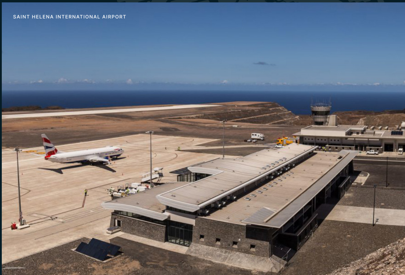
SAINT HELENA INTERNATIONAL AIRPORT

Scheduled status meetings are arranged to monitor progress with the client and a communication framework is established. At commissioning, the project office ensures that the necessary skills are present for testing, snagging and managing completion. This is followed by a handover of documentation and training.