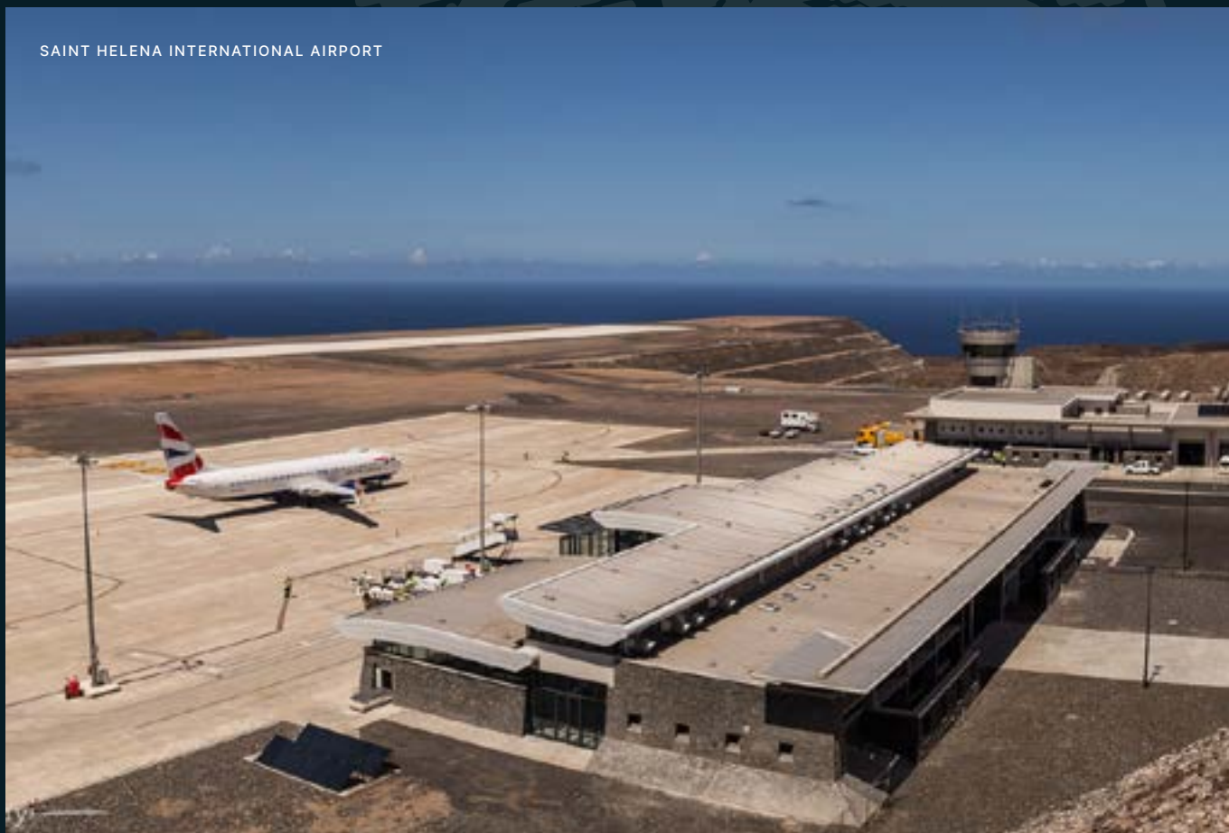
SAINT HELENA INTERNATIONAL AIRPORT

Scheduled status meetings are arranged to monitor progress with the client and a communication framework is established. At commissioning, the project office ensures that the necessary skills are present for testing, snagging and managing completion. This is followed by a handover of documentation and training.