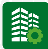
BUILDING MANAGEMENT SYSTEMS